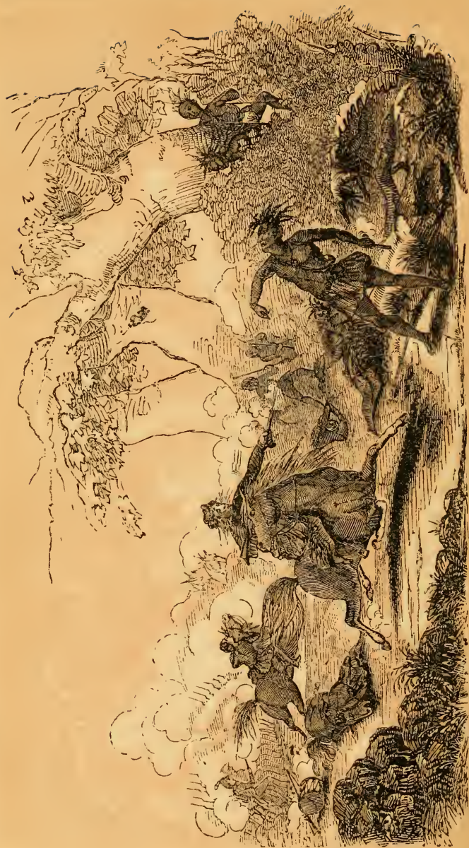
BATTLE WITH THE INDIANS — DEATH OF TECUMSEH.